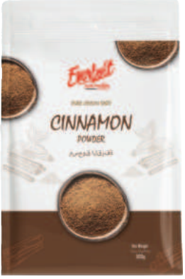
Cinnamon Powder 100g / 200g / 500g/ 1Kg