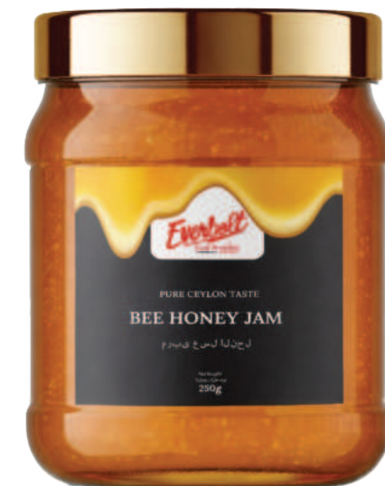
Bee Honey Jam