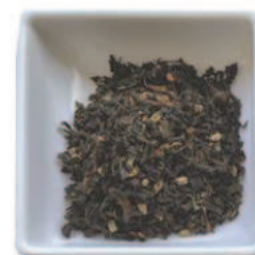
Artisan Wild Tea Blend 10