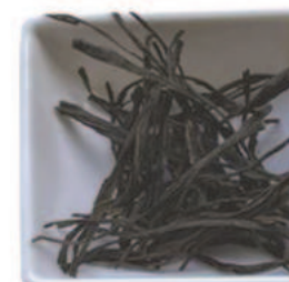
Artisan Wild Tea Blend 13