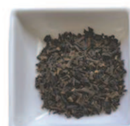
Artisan Wild Tea Blend 06