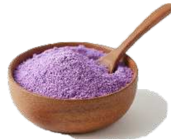
Eight Stamen Osbeckia