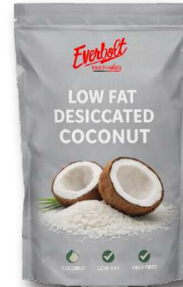
Low Fat desiccated Coconut