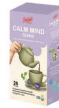
Calm Mind Blend 30g