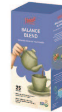
Balance Blend 30g