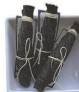
Artisan Wild Tea Blend 07