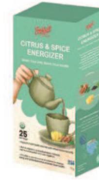
Citrus & Spice Energizer 30g