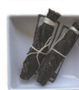
Artisan Wild Tea Blend 08