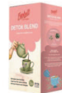
Detox Blend 30g