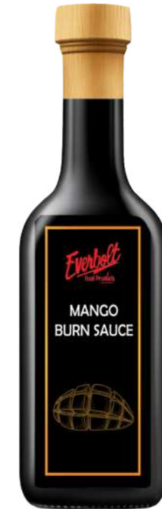
Mango Burn Sauce