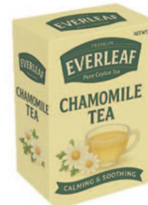
Chamomile Tea 50g