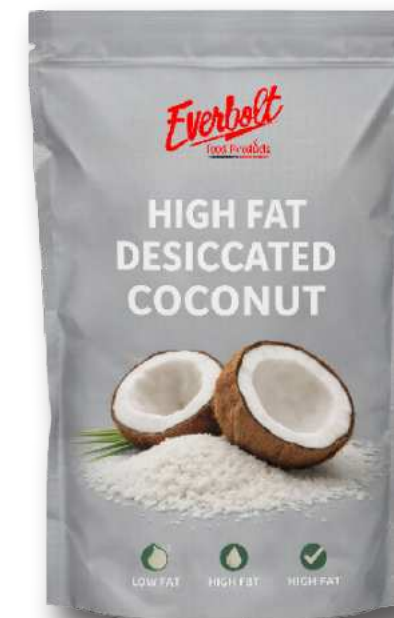
High Fat desiccated Coconut