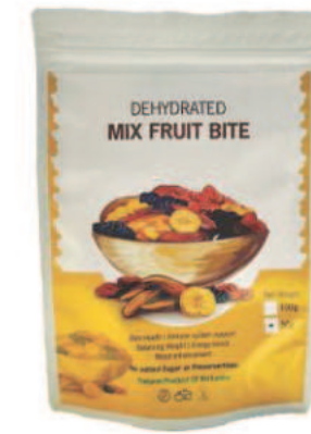
Dehydrated Mixed Fruits 50g