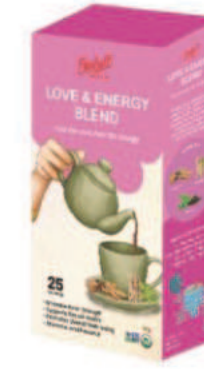
Love & Energy Blend 30g