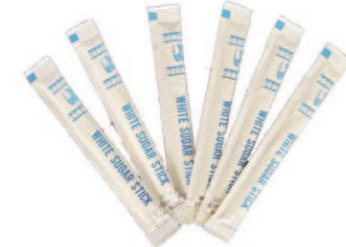
White Sugar Stick 5g