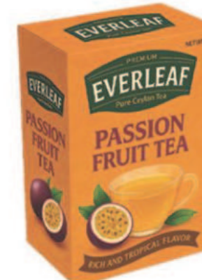
Passion Fruit Tea 50g