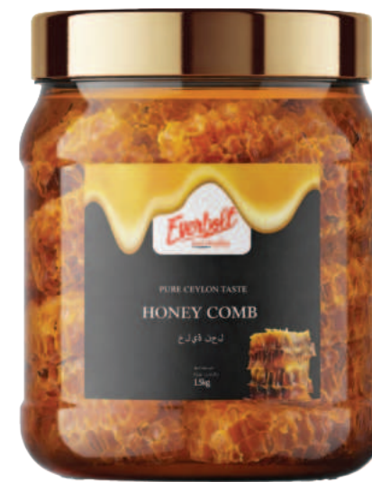
Bee Honey Comb