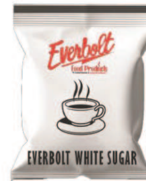
White Sugar Sachet 5g / 7g