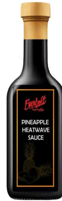
Pineapple Heatwave Sauce