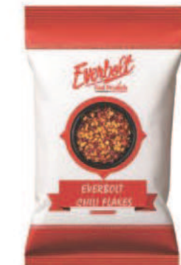
Chili Flakes Sachet 1g