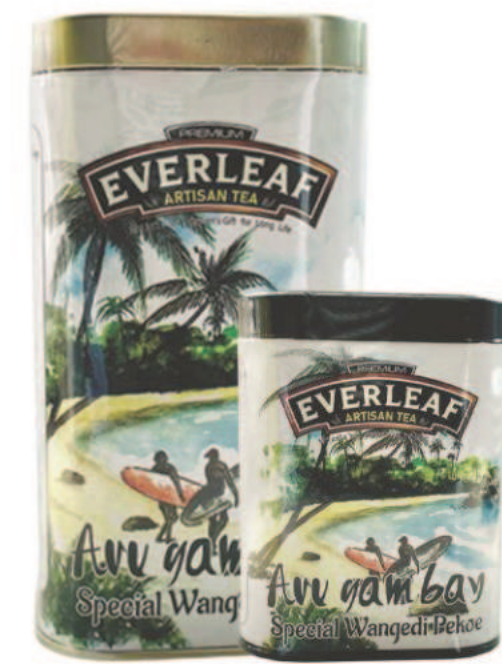
Special Wangedi Pekoe 100g / 50g