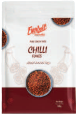
Chilli Flakes 100g / 200g / 500g/ 1Kg