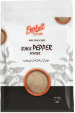
Black Pepper Powder 100g / 200g / 500g/ 1Kg

Everbolt premium spicest range, sourced from carefully selected farms and traditional growing regions of Sri Lanka. Harvested at peak maturity and processed using time-honored methods to preserve natural aroma, flavor, and essential oils, each spice delivers authentic taste and consistent quality. Free from artificial colors, preservatives, and additives, Everbolt spices retain their pure, natural character.