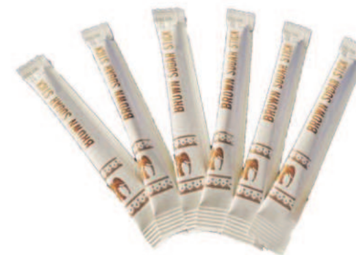
Brown Sugar Stick 5g