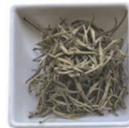
Artisan Wild Tea Blend 01

Everleaf Artisan Wild Tea represents the purest essence of nature. Sourced from untouched, wild regions and handpicked by skilled local artisans, this exceptional tea range embodies our commitment to sustainability, authenticity, and unmatched quality. Each leaf is selected from naturally growing tea plants thriving in biodiverse environments, far from conventional plantations.