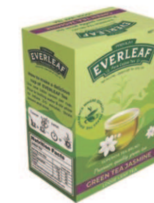
Jasmine Flavored Green Tea 50g