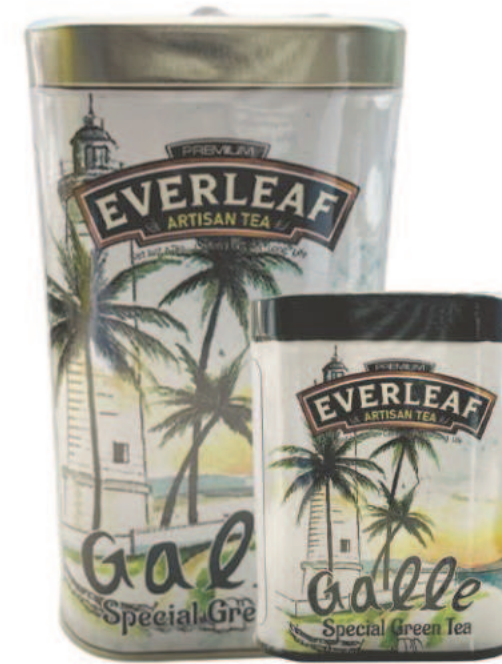
Special Green Tea 100g / 50g

This special collection includes four unique teas, each offering its own character and charm. Made without the use of chemicals or artificial additives.