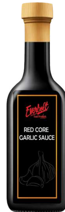
Red Core Garlic Sauce