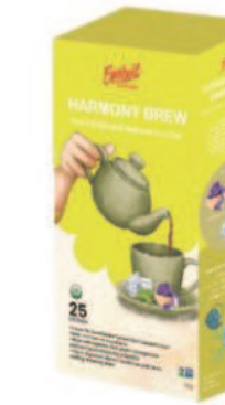
Harmony Brew 30g