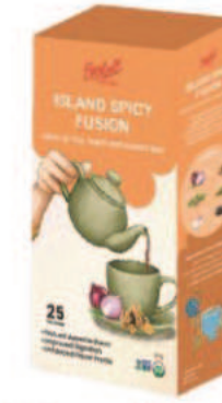
Island Spice Fusion 30g