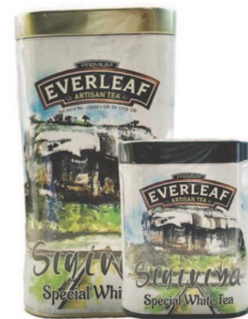
Special White Tea 100g / 50g