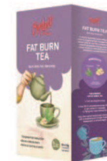
Fat Burn Tea 30g