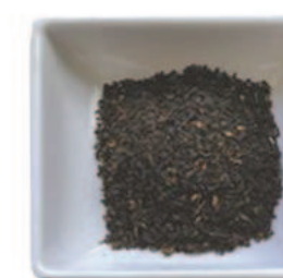
Artisan Wild Tea Blend 11