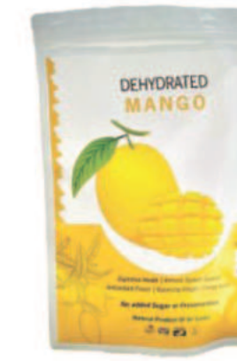
Dehydrated Mango 50g