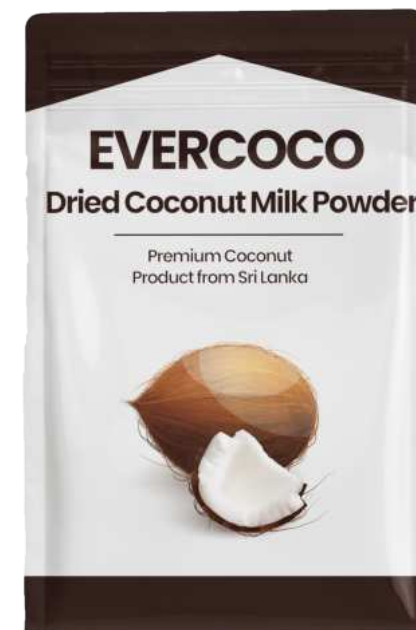
Dried Coconut Milk Powder