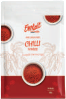
Chilli Powder 100g / 200g / 500g/ 1Kg