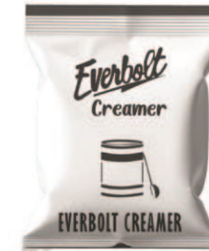
Creamer Sachet 5g