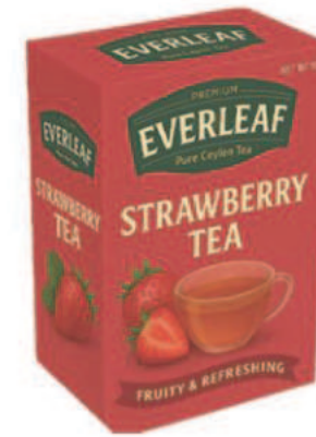
Strawberry Tea 50g