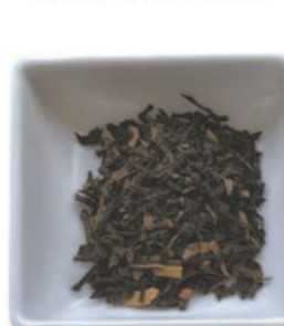
Artisan Wild Tea Blend 09