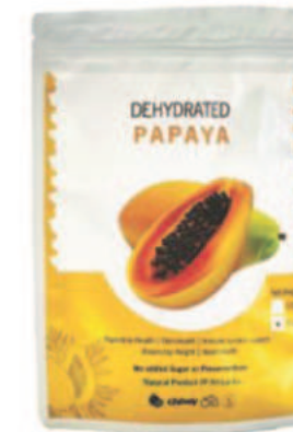
Dehydrated Papaya 50g