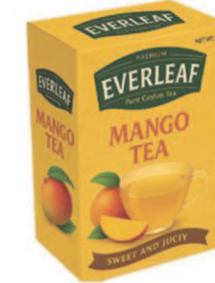
Mango Tea 50g