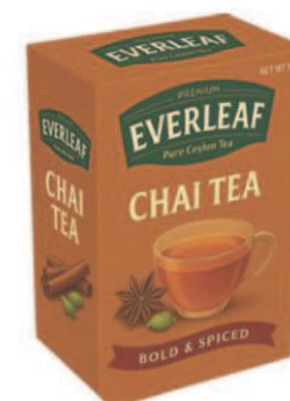
Chai Tea 50g