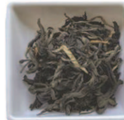
Artisan Wild Tea Blend 04