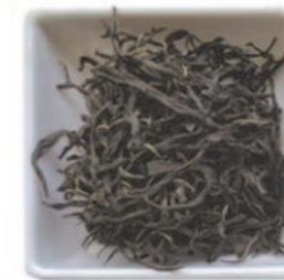
Artisan Wild Tea Blend 03