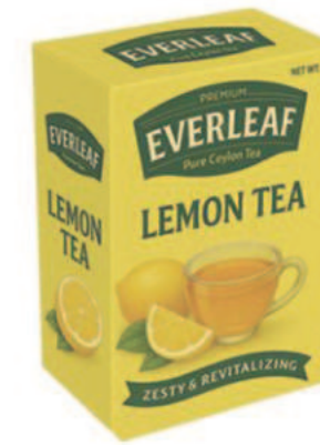
Lemon Tea 50g