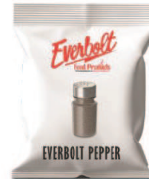
Pepper Sachet 0.5g