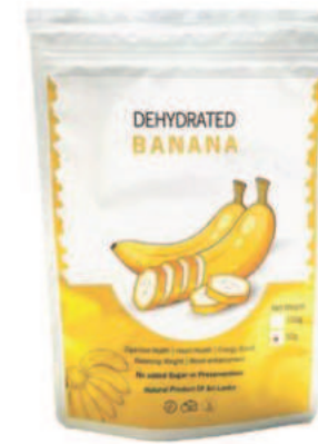
Dehydrated Banana 50g