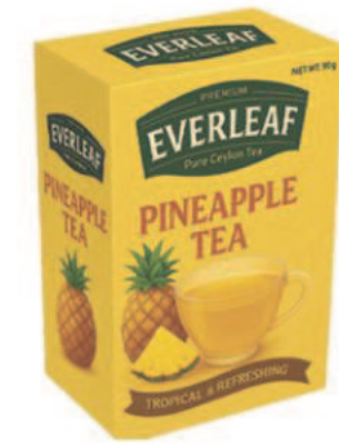
Pineapple Tea 50g