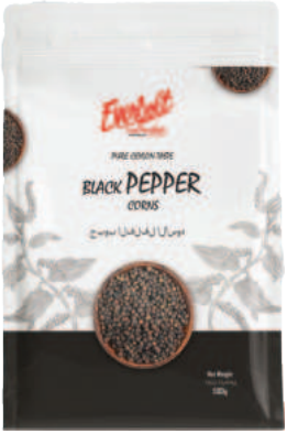
Black Pepper Corns 100g / 200g / 500g/ 1Kg