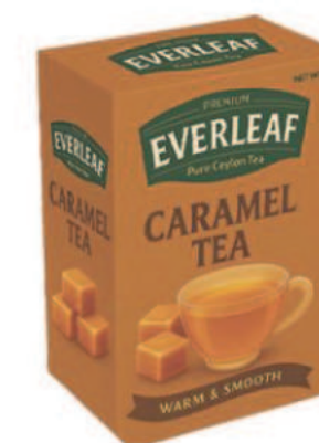
Caramel Tea 50g