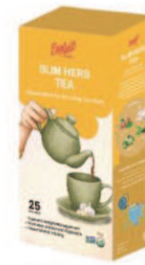
Slim Herb Tea 30g