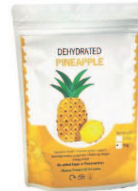
Dehydrated Pineapple 50g