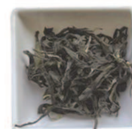
Artisan Wild Tea Blend 02