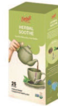
Herb Soothe 30g