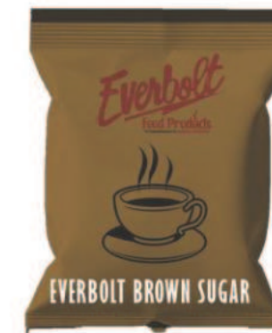
Brown Sugar Sachet 5g / 7g