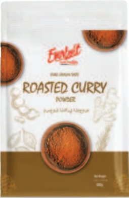
Roasted Curry Powder

Everbolt premium spices range, sourced from carefully selected farms and traditional growing regions of Sri Lanka. Harvested at peak maturity and processed using time-honored methods to preserve natural aroma, flavor, and essential oils, each spice delivers authentic taste and consistent quality. Free from artificial colors, preservatives, and additives, Everbolt spices retain their pure, natural character.