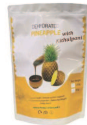
Dehydrated Pineapple with Kithul Pani 50g