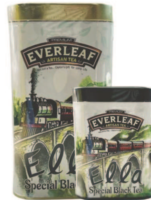
Special Black Tea 100g / 50g