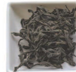
Artisan Wild Tea Blend 05