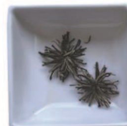
Artisan Wild Tea Blend 12