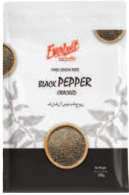
Black Pepper Cracked 100g / 200g / 500g/ 1Kg