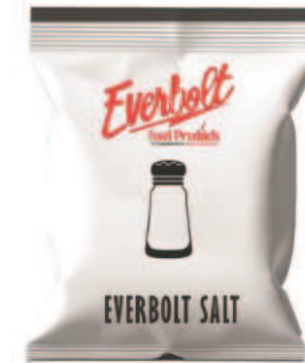
Salt Sachet 1g